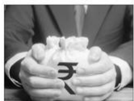
New businesses accounted for 7% of the AUM and 22% of the overall disbursement mix in Q3FY23

"The new businesses account for around 7% of the overall AUM. These businesses are having a good run and the growth may look a little higher because of a small base. That is the whole purpose of bringing in a diversified portfolio. If you focus only on auto loans, which are very cyclical in nature, we